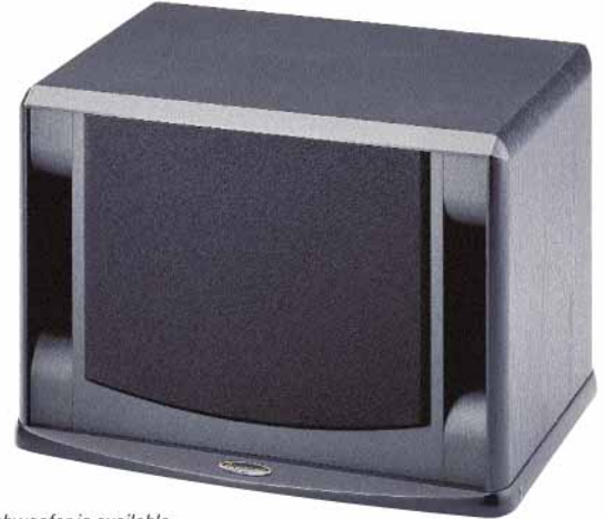
The Subwoofer is available in Black woodgrain & Rosewood finish.