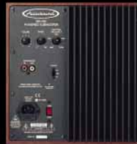
SW 250 Amplifier