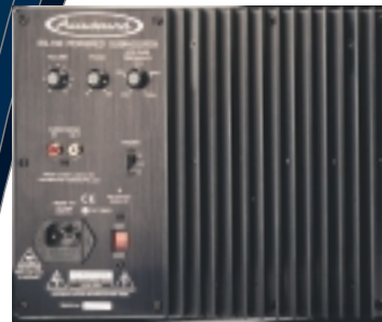
Rear of ES-150 Black Piano Finish Subwoofer