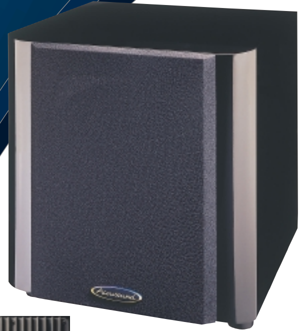
ES-150 Black Piano Finish Subwoofer (sold separately)

The ES-150 Subwoofer gives you low frequency effects from movies and added deep bass that no front speaker can deliver at normal levels for music. The ES-150 has a built in "Low End Drive" amplifier with volume, frequency, and phase controls. It also has an "Auto" on/off standby switch, which enables it to turn on automatically when a signal is delivered and turn off again after 20 minutes when no signal is delivered. It comes with a low level input to connect straight to your home theatre receiver. The ES-150 has a front firing bass driver and a 200mm down firing Passive Radiator. This design eliminates the high volume of air passing through plastic tubes that cause "choofing".